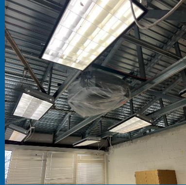
New Daikin VRF Cassette Systems